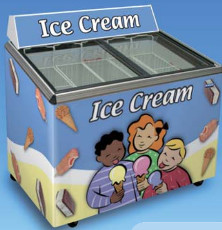
Light bar and custom graphics.