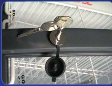
Lid lock and keys.