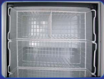
Baskets and divider.