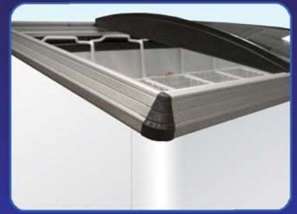
Round exterior edges.